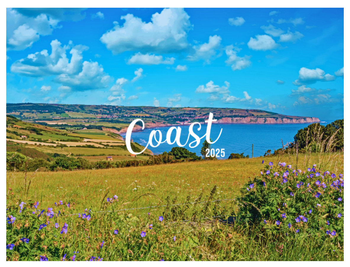
It's time to bag a spring stay and sometimes a couple of days is all you need! Enjoy a blast on the beach, fresh seafood by the waterside then a peaceful night's sleep after all the sea air, the coast is calling!

Ahead of the school holidays, you'll find plenty of space for exploring art galleries, museums and markets, from Durham's Seaside Market in Seaham to Devon's local Friday market in Dartmouth , stock up on artisan produce and crafts with the locals.